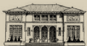
McMENAMINS KENNEDY SCHOOL